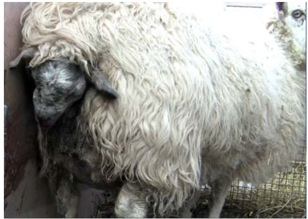
Fig 14: The dissection and removal of a foetus such as a hung lamb which cannot be delivered naturally must never be used to remove a live lamb.

80 - Embryotomy, the dissection and removal of a foetus which cannot be delivered naturally, should be carried out on dead lambs only. It should never be used to remove a live lamb.