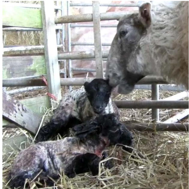
Fig 10: Successful delivery of two live lambs signals the end of second stage labour.

not rupture until the ewe stands up after the lamb has been expelled. The delayed rupture of the amnion, referred to colloquially as the lamb being "sheeted" or "born with the skin over its nose", may result in death of the lamb due to asphyxiation. This scenario is not uncommon in multiple births especially with later born lambs. In ewes with multiple litters the interval between birth of the lambs varies from 10 to 60 minutes; intervention should be considered if the interval is more than one hour.