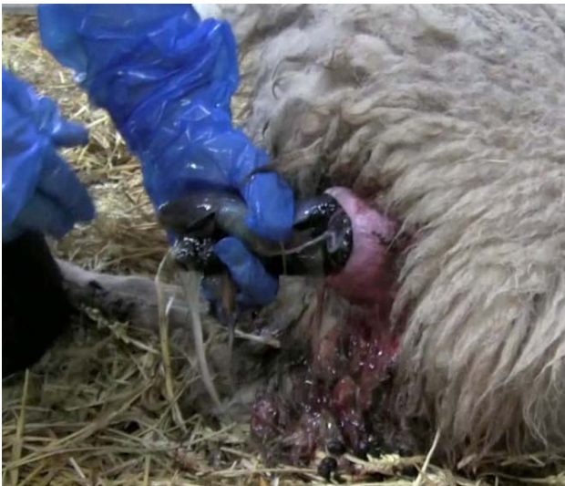
Fig 4: Arm-length disposable plastic gloves should be worn especially if there is the risk of human infection from aborting sheep.

Some veterinary surgeons prefer not to wear gloves but always thoroughly wash their hands and arms (see below) and use large amounts of obstetrical lubricant.