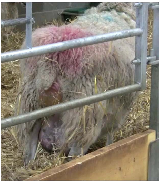
Fig 9: Appearance of the water bag at the end of first stage labour.