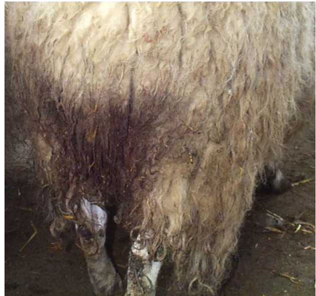
Fig 17: There is a red/brown foetid discharge on the wool of the tail and perineum.

Typically, there is dramatic improvement in the sheep's demeanour and appetite within 12 hours of antibiotic injection.