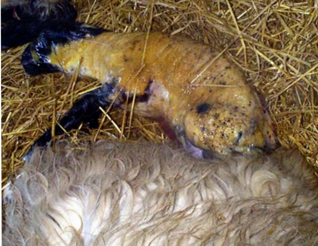
Fig 15: The lamb should be left for a number of minutes with the umbilical vessels still intact.

The lamb should be left for a number of minutes with the umbilical vessels still intact. The newborn lamb should not instantly be snatched away and placed at the ewe's head. It may take up to 30 seconds before the lamb takes its first deep breath but this is normal. There are no indications to swing the lamb around by the hindlegs - any fluid which appears at the mouth or nostrils during these aeronautics originates from the lamb's stomach not its lungs.