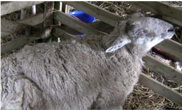
Fig 12: Ewe showing signs of pain with continual forceful straining and vocalization after attempted delivery of a large single lamb.

Sheep 36 - It is an offence to cause, or to allow, unnecessary pain or unnecessary distress by leaving a sheep to suffer.