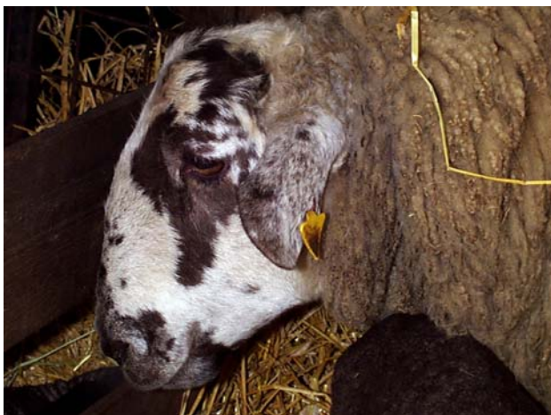
Fig 16: The ewe is depressed, ears down, listless, and has a poor appetite.