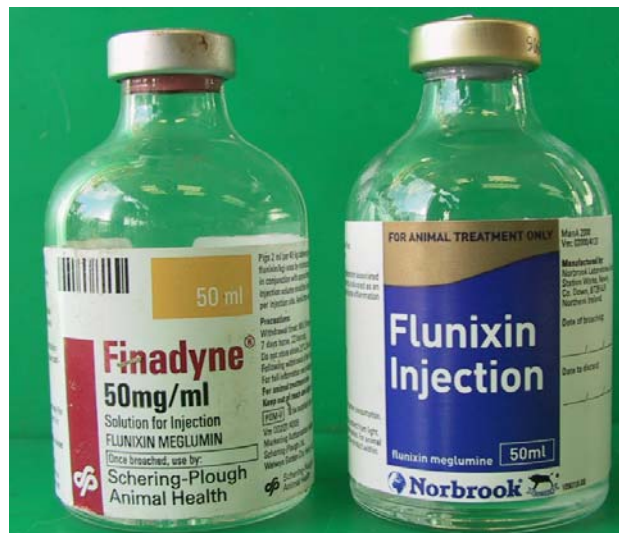
Fig 2: Flunixin is a non steroidal anti-inflammatory drug commonly used by farmers and vets after an assisted lambing.

Non steroidal anti-inflammatory drugs (NSAIDs, analgesic drugs, pain killers) have many applications at lambing time and instructions concerning their use