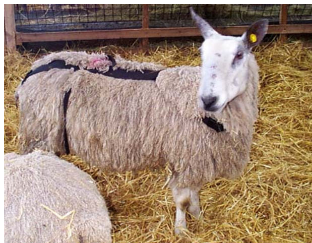
Fig 3: The occurrence of vaginal prolapse cannot be predicted. Timely use of a harness, which was available on the farm, has proven successful in this ewe.