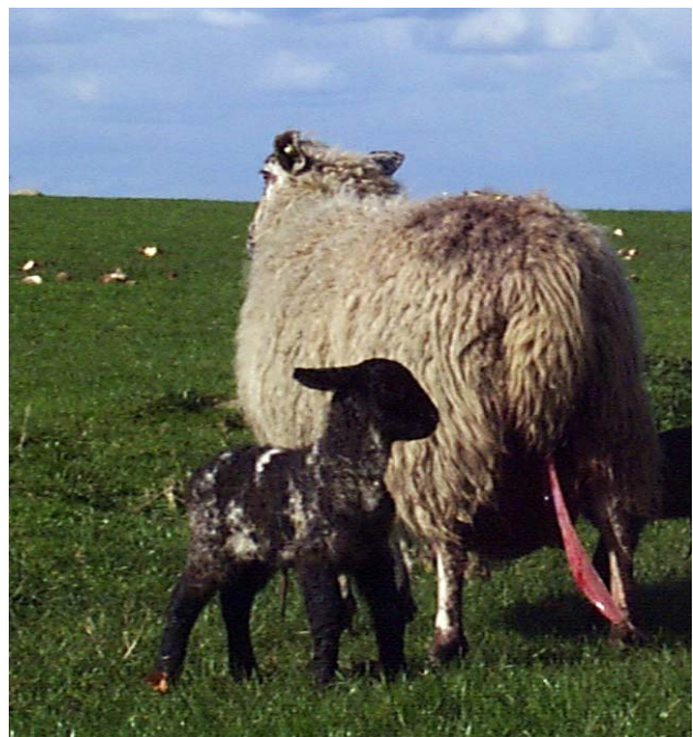
Fig 11: Third stage labour is completed by expulsion of foetal membranes which usually occurs 2-3 hours after birth of the lambs.

Third stage labour is completed by expulsion of foetal membranes which usually occurs within 2-3 hours of the end of second stage labour.