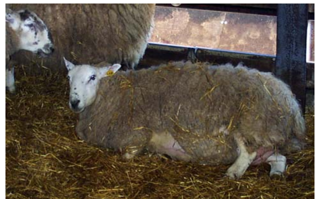
Fig 6: Early first stage labour – there are periods of increased activity with abdominal contractions lasting 15-30 seconds.

First stage labour is represented by cervical dilation which takes 3-6 hours but is more rapid in older ewes.