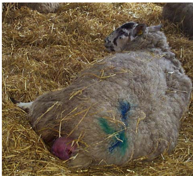
Fig1: The most significant single influence on the welfare of any flock is the shepherd who must have the knowledge and practical experience to deal with a wide range of problems.

'Animals shall be cared for by a sufficient number of staff who possess the appropriate ability, knowledge and professional competence. The most significant single influence on the welfare of any flock is the shepherd.'