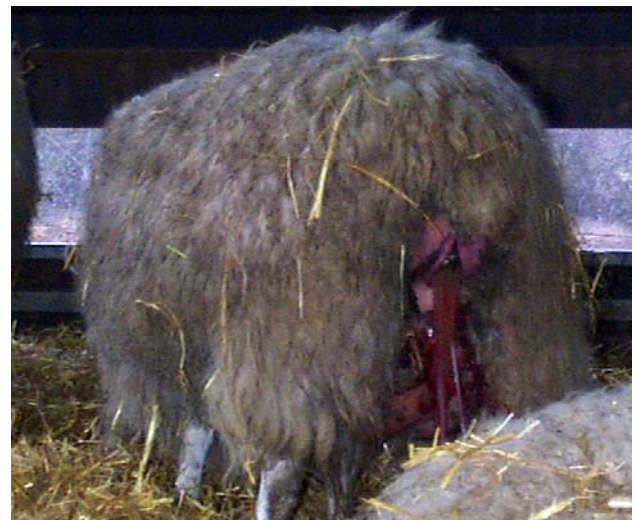
Fig 7: During first stage labour a thick string of mucus is often observed hanging from the vulva.

There are various behavioural changes including the ewe frequently does not come to the feed trough or leaves early before other sheep in the group. The ewe seeks a sheltered area of the field or corner of the barn and will paw at ground, frequently sniffing at this area, and alternatively lying/standing. These periods of increased activity often occur at 15 minute intervals with abdominal contractions lasting 15-30 seconds.