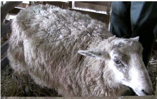
Fig 13: Same ewe as above but 10 minutes after extradural injection to block pain.

76 - A large proportion of ewe mortalities occur during the period around lambing, so particular skill and expertise are required at this time. Severe damage can be caused through inexperience when assisting a ewe in difficulties. Shepherds should therefore be experienced and competent before having responsibility for a flock at lambing time.