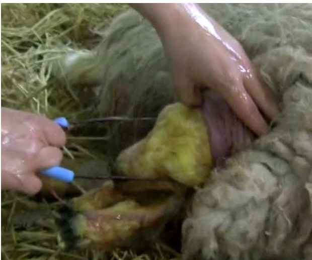
Fig 5: Assisted delivery using a lambing "snare". While gloves are not worn in this situation, great care is taken to thoroughly wash hands, arms and all obstetrical equipment used in the procedure in approved surgical scrub solution.

Some veterinary surgeons prefer not to wear gloves but always thoroughly wash their hands and arms (see below) and use large amounts of obstetrical lubricant.