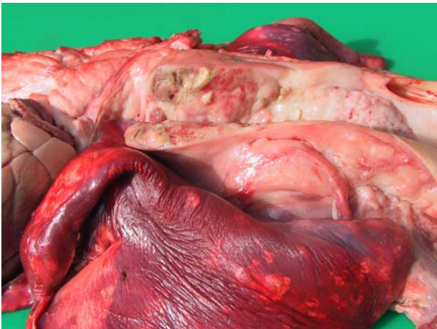
Fig 7: Spread of infection to the lymph nodes within the chest – there has been no further spread and this infection did not produce clinical signs.

The disease is characterised by abscessation of superficial lymph nodes particularly the parotid (base of the ear), submandibular (below the jaw), popliteal (hindleg), precrural (hindleg), and prescapular (foreleg) lymph nodes. This form of the disease is often referred to as the cutaneous or superficial form of CLA. Spread of infection to the lymph nodes within the chest and internal organs including lungs, spleen, kidneys and liver, constitutes the visceral or internal form of CLA. Sheep with the superficial form of CLA may show clinical signs of illness only when enlargement of the abscess causes compression of the airway.