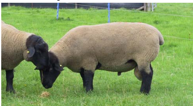
Fig 1: Fighting causing skin lesions on the head is the major means of disease transmission between rams in the UK

Caseous lymphadenitis is caused by the bacterium Corynebacterium pseudotuberculosis . Transmission occurs either directly between sheep during close confinement or, indirectly, via contaminated shearing equipment. Fighting, causing skin lesions on the head, is the major means of disease transmission between rams in the UK. The prevalence of infection increases with age and in sheep kept under intensive management conditions.