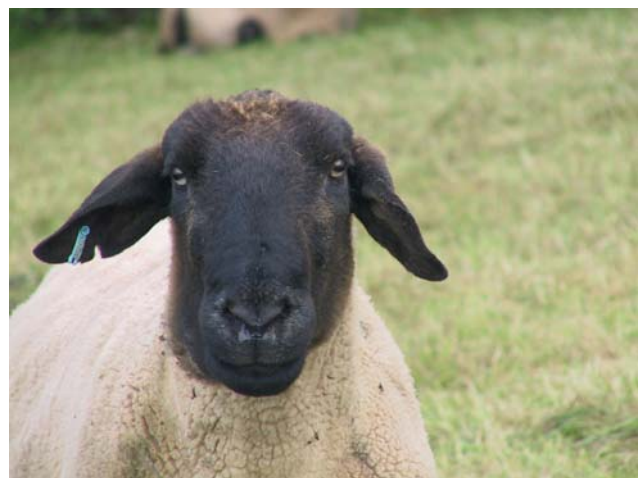
Fig 9: Local abscess unrelated to a lymph node (see above) – this is not CLA.