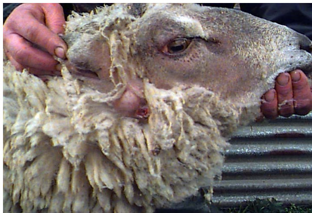
Fig 5: CLA abscessation of the parotid lymph node.

CLA is characterised by abscessation of superficial lymph nodes (parotid lymph node in this ram).