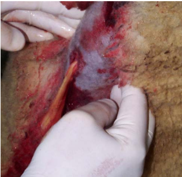
Fig 11: Lancing and drainage of above abscess by a veterinary surgeon.

Common differential diagnoses for the visceral form of CLA affecting the chest include chronic suppurative pneumonia, pleural or mediastinal abscesses, and ovine pulmonary adenocarcinoma (OPA, Jaagsiekte).