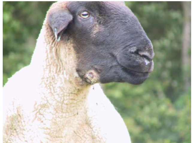
Fig 8: Local abscess unrelated to a lymph node (see below) – this is not CLA.

Definitive diagnosis of the cutaneous form of CLA should also include actinobacillosis and tuberculosis, and local abscess formation.