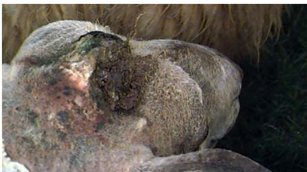
Fig 2: Fighting lesion on the poll may have been the route of CLA infection in this ram.