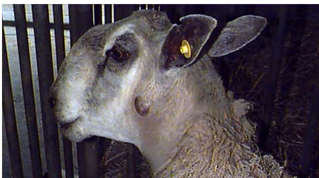
Fig 3: CLA abscessation of the parotid lymph node.