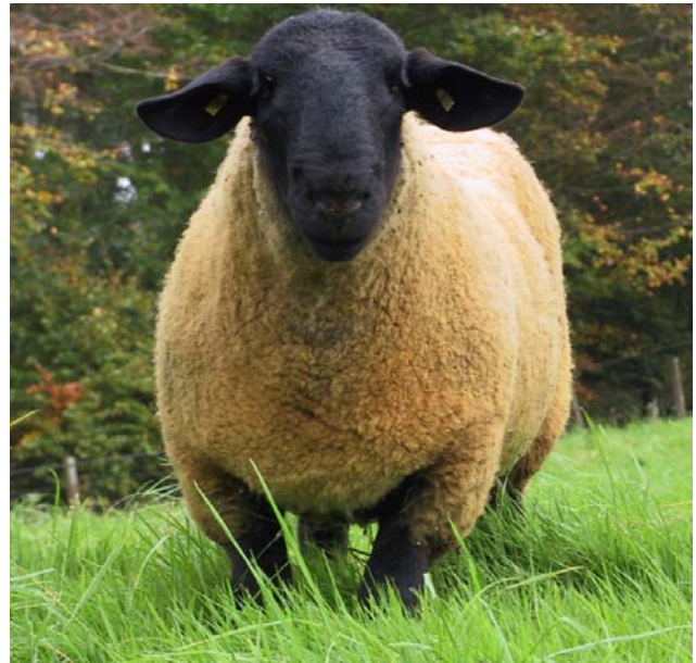
Fig 12: Replacement breeding stock must be purchased from disease-free flocks whenever possible.

whenever possible. Alternatively, sheep should be purchased and blood testing undertaken before admission.