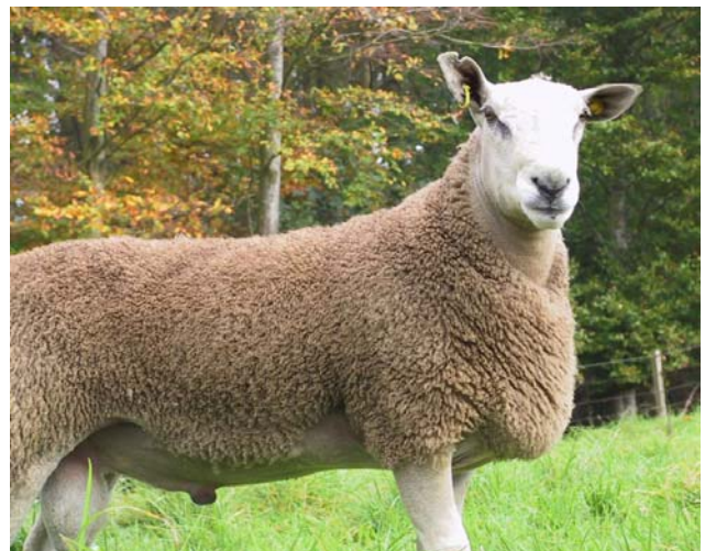
Fig 13: Purchased animals - must be inspected before purchase and quarantined for at least two months.

Commercial vaccines have reduced the incidence of CLA within a flock but do not prevent all new infections nor cure sheep already infected. Commercial vaccines are used in many countries with a high CLA prevalence such as the USA and Australia but presently not in many countries within Europe.