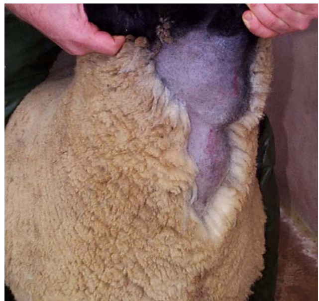
Fig 10: Subcutaneous abscess unrelated to lymph node.