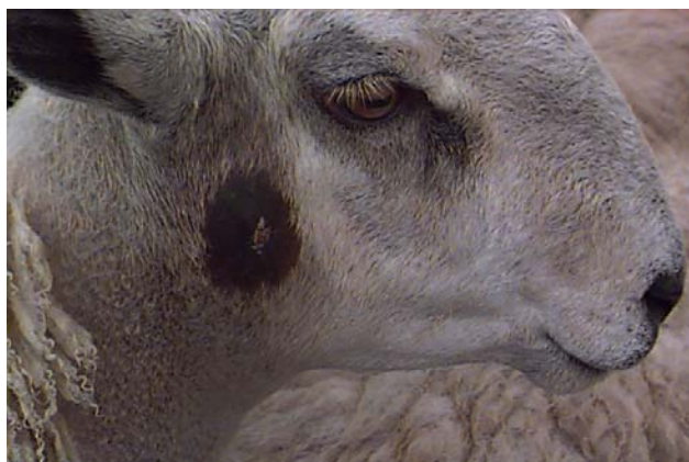
Fig 4: CLA abscessation of the parotid lymph node.